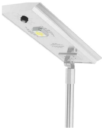
LDR Street Light